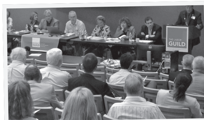
ACA Forum June 20th