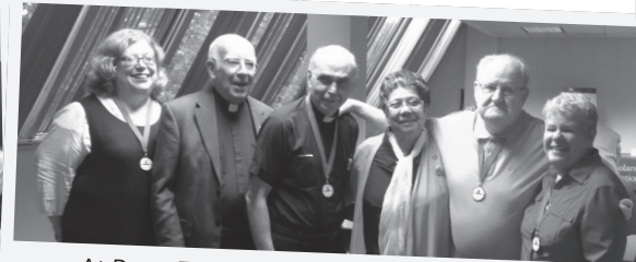
At Pope Francis & Economic Justice Panel at Catholic Scholars for Worker Justice Conference