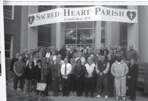
Guild School Spring 2014 Class Photo