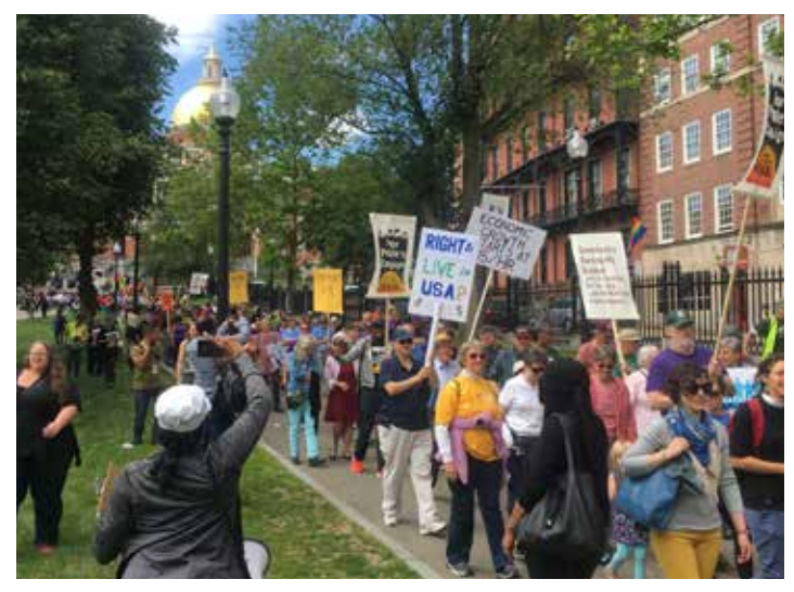
Faith, labor and community allies march through Boston Common for an action on "Education, Living Wage Jobs, Income and Housing" as part of the Massachusetts Poor People's Campaign .