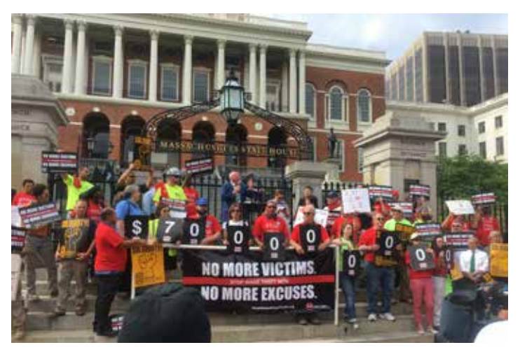
Community Labor United (CLU) and the Stop Mass Wage Theft coalition rallied in front of the statehouse on June 20th to advance the "Act to Prevent Wage Theft and Promote Employer Accountability" bill.