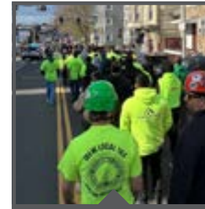
May Day Celebrations: Members of IBEW Local #103 in a procession in East Boston.