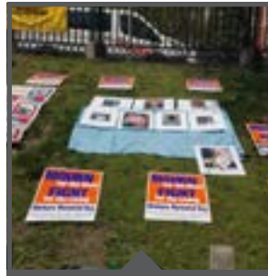
Workers' Memorial Day: MassCOSH displayed framed pictures of the 51 total Massachusetts workers that died on the job in 2022.