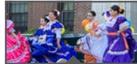
May Day in Chelsea means community!

Please remember that your continuing organizational or personal membership with the Labor Guild is the best way to ensure the future of our Labor School classes!