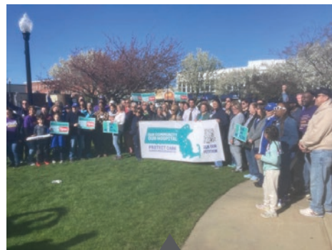
MNA SEIU Standout April 2024

With many years of participation in the Channel 7 Catholic Mass for Labor Day Weekend, we joined the local network Catholic TV for the