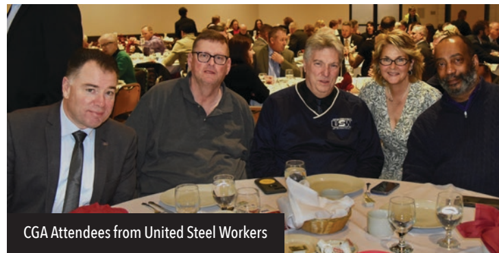
CGA Attendees from United Steel Workers