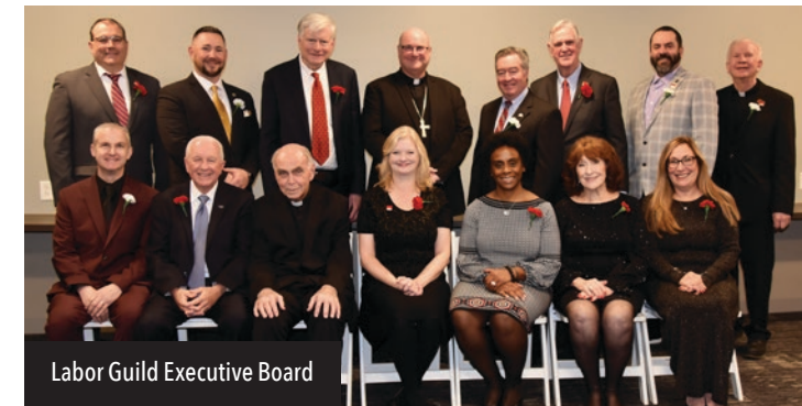
Labor Guild Executive Board